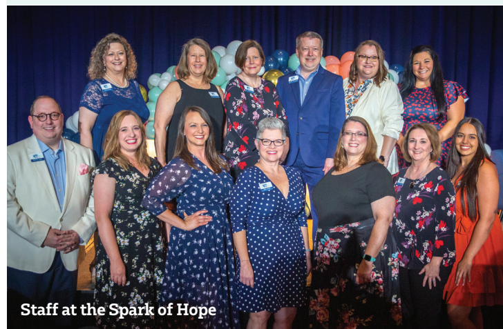
Staff at the Spark of Hope